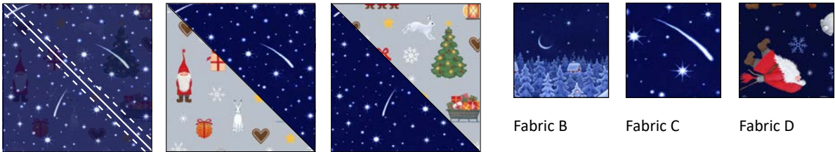
Option 1 - left diagonal HSTs

Fabrics F and G (the two Festive fun prints) are directional prints. Pay attention when creating your half square triangles (HST) using them as otherwise you may end up with the print not facing the right way up when you create your star blocks. Test by placing two squares right sides (RS) together and folding back the top fabric along the diagonal.