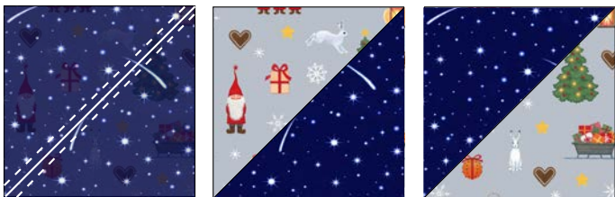
Option 2 - right diagonal HSTs