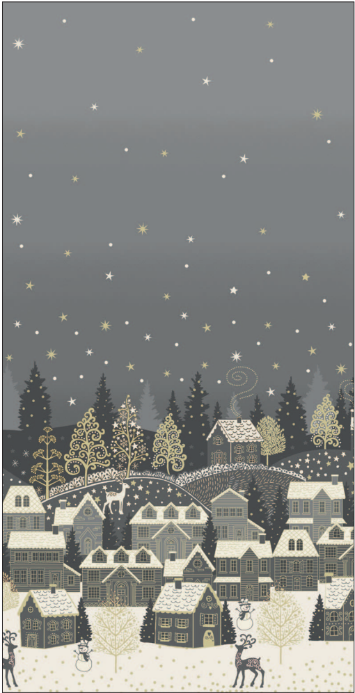
2363/S Double Border Actual size of image shown 12" x 22" (30 x 56ms)