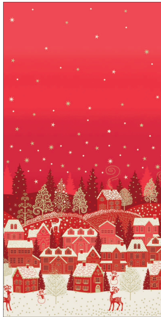
2363/R Double Border

Actual size of image shown 24" x 44" (60 x 112cms)