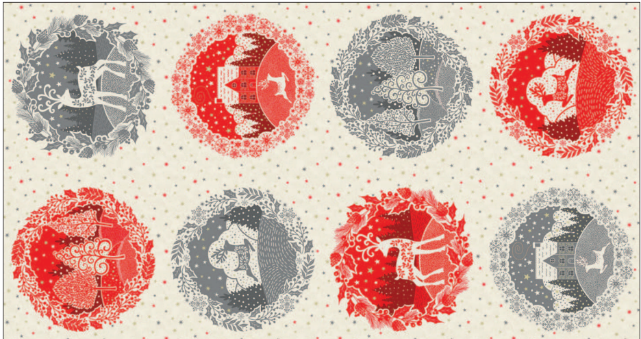
2361/1 Scandi Circle Panel Actual size of image shown 24" x 44" (60 x 112cms)