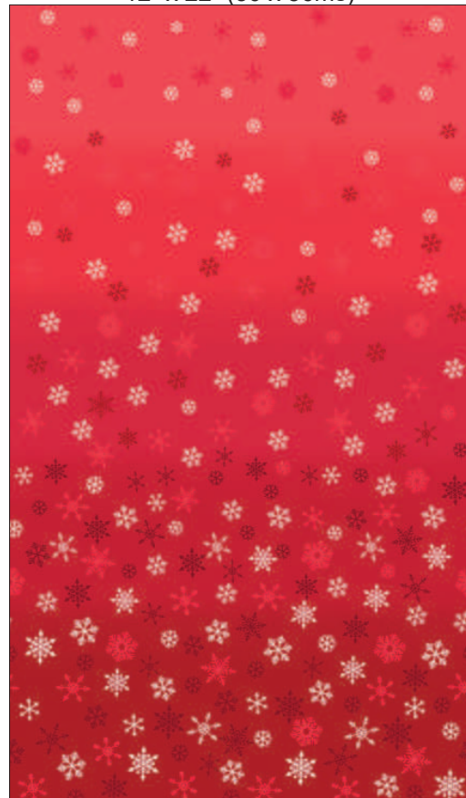
*2248/R4 Snowflake Ombre Double Border

Actual size of image shown 12" x 22" (30 x 56ms)