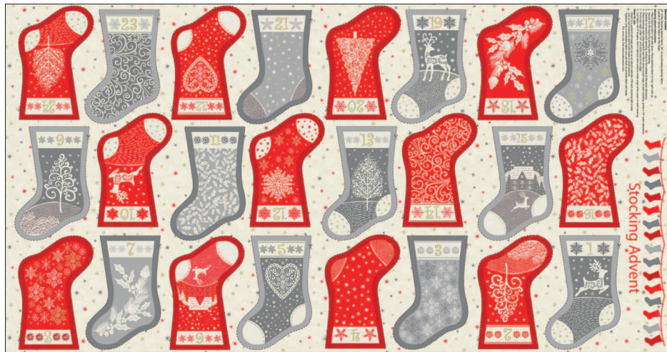
2362/1 Mini Stocking

Actual size of image shown 24" x 44" (60 x 112cms)