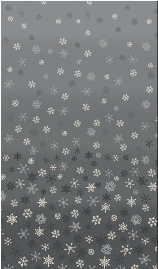
*2248/S Snowflake Ombre Double Border Actual size of image shown 12" x 22" (30 x 56ms)